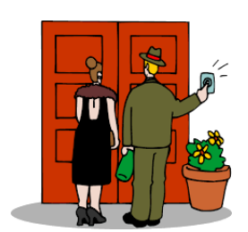
two people ringing a doorbell at a front door