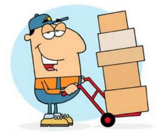
person moving a stack of boxes