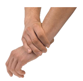
hand grabbing arm

Nobody should hold my arms, legs or body down unless it is to keep me from hurting myself or someone else or as part of a medical procedure. Only a person trained to help me be safe can help me not hurt myself or someone else.