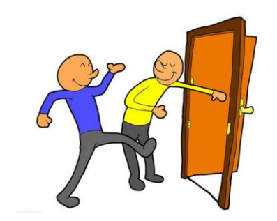
person opening a door for another person to walk through

I choose where I want to be. I can keep getting services until I say I don't want them or if the agency says I don't need them anymore; if I have a guardian, my guardian will help me make that decision. I can stop getting services any time I want.