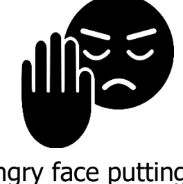
angry face putting up hand to stop something

I have a right to know about medications and services in a way that I can understand. I can say no to services and medications; if I have a guardian, my guardian will help me make those decisions. My decisions will be written in my file.