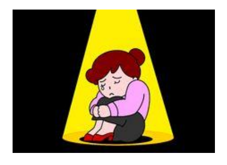
woman sitting in the dark and crying