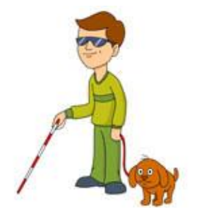
person with a visual impairment with a walking stick and service dog

I have the right to ask people to attend my planning meeting, including my family members and advocates. I don't have to invite my family if I don't want them at my meeting.